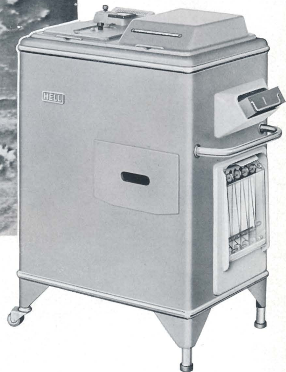
TM 835 Automatic Telephoto Recorder (APT/HRIR)

Combined equipment for fully automatic recording, developing and drying of cloud photos by the APT system (daylight photographs) and HRIR system (night photographs), either the starting programme according to the APT system or the marker pulses according to the HRIR system being utilised and the drum speed switched automatically. Recording is stopped with both systems by end contact.